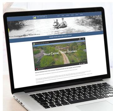
HIGHLINE CANAL CONSERVANCY Video Production, Graphic Design