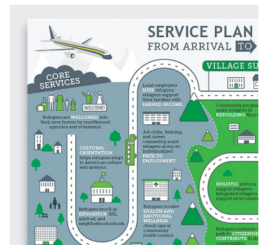
COLORADO DEPARTMENT OF HUMAN SERVICES Graphic Design