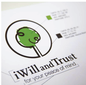
IWILLANDTRUST Brand Identity & Strategy, Graphic Design