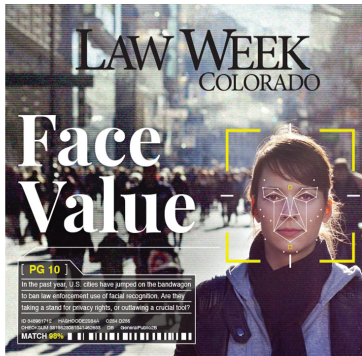
LAW WEEK COLORADO Brand Identity & Strategy, Photography, Video Production